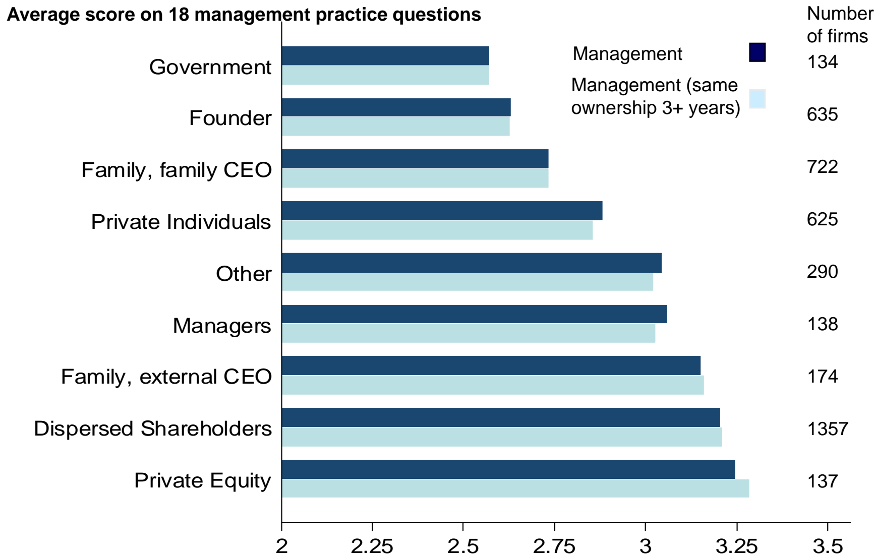
Figure 2: Private equity owned firms have the best raw management practice scores on average

Note: Sample of 4,221 medium-sized manufacturing firms. The bottom bar-chart only covers the 3696 firms which have been in the same ownership for the last 3 years. The “Other” category includes venture capital, joint-ventures, charitable foundations and unknown ownership.