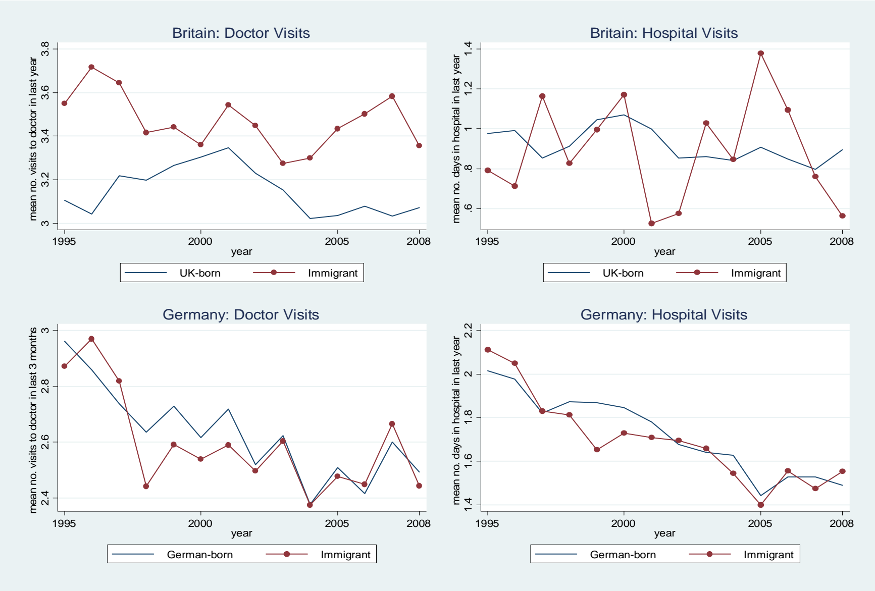
Figure 1. Number of Visits to Doctors and Hospital by Time